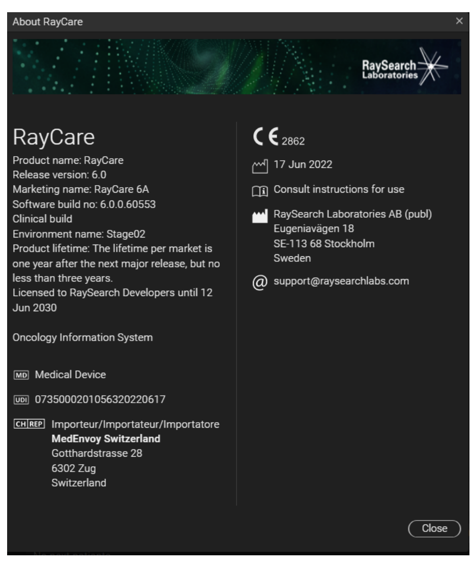
Figure 1. The About RayCare dialog.