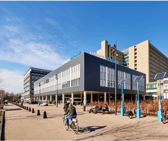
Catharina Hospital, Eindhoven, Netherlands

Catharina Hospital in Eindhoven is a leading clinical teaching hospital in the Netherlands that is renowned for cancer treatment. Almost all specialisms are represented, and the hospital also serves as a referral site for specialized care, including oncology, cardiology, dialysis and bariatric care.