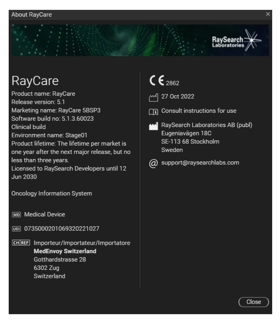
Figure 1. The About RayCare dialog.